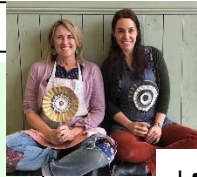
I ♥ ART

MAY * Parking Lot Program extended through the end of May * Shelter closes May 4. The program continues as the 3 remaining families are given motel rooms with kitchenettes gift cards for groceries and gas, and regular staff visits.