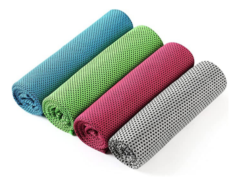
Cooling Towel 4 Pack about $12 for 4 towels