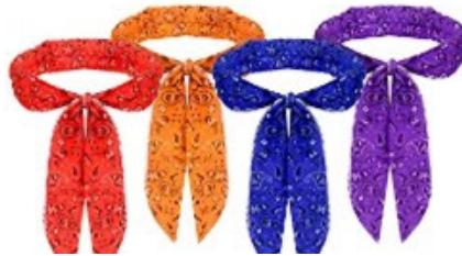
Cooling Neck Wraps

(I ordered from Amazon and had them sent directly to the Winter Nights office: 404 Gregory Lane, #7, Pleasant Hill, CA 94523 ):