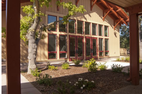
St Andrew's Presbyterian Church - Pleasant Hill