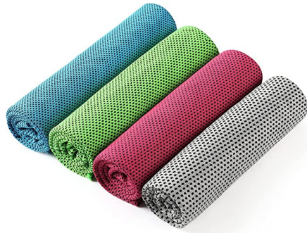
Cooling Towel 4 Pack about $12 for 4 towels