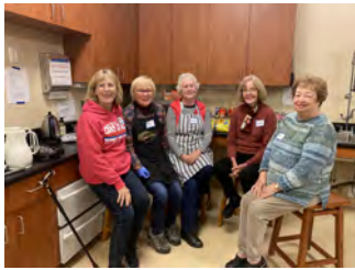
Choir members can really cook and sing!