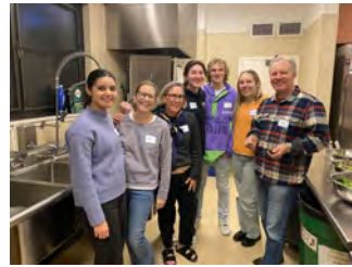
Families cook together