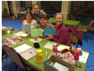
Temple Isaiah volunteers getting crafts ready.

There were crafts for the kids, and a volunteer brought 3 puppies to visit, which the children loved. On New Year's Eve the families were treated to a visit to Rockin' Jump where the children were worn out trampolining.