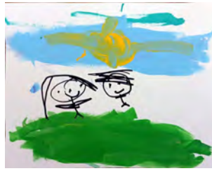
A child's art