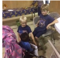
2017 - 3 little boys