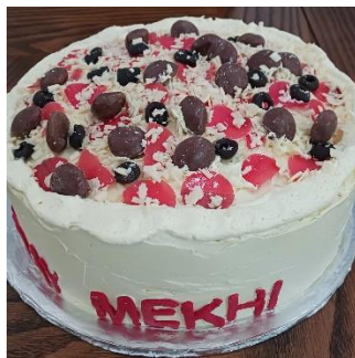
It's a pizza cake!

The sausage is Milk Duds, the pepperoni is fruit leather, the olives are black licorice and the cheese is grated white chocolate. So clever!