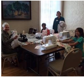
2016 - Sewing Table