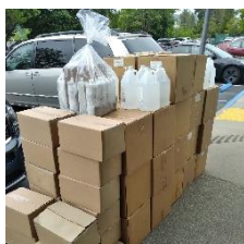
Donation from Camino Pablo