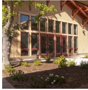
Saint Andrews Presbyterian Church