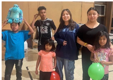
Four children from the Honduran Family and two young ladies who were volunteers and translators.

By Saturday, May 28th, there were 2 families housed, and 5 families remained at the Shelter. Keep those good thoughts and prayers coming!