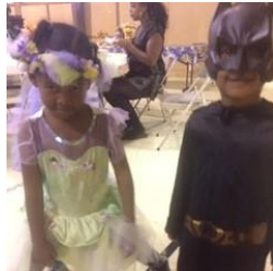
2017 - Children in Halloween Costumes