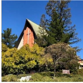
Orinda Community Church