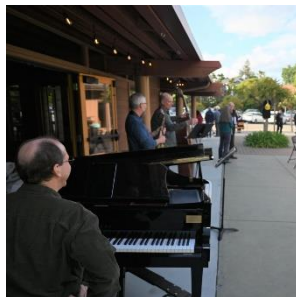
A bit of jazz at the BBQ

Four members of Winter Nights staff and two members of the Board of Directors also attended the event and were able to meet members of the parish, share information about our programs, and to personally thank Resurrection for their participation as a Family Shelter host site and funding support.