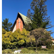
Orinda Community Church