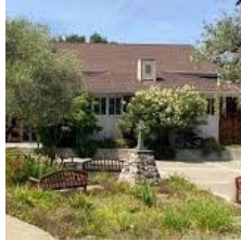
St. Timothy's Episcopal Church - Danville

You are all the best. Thanks for your big hearts and hard work.