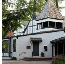
Lafayette United Methodist Church