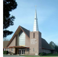
Concord United Methodist Church