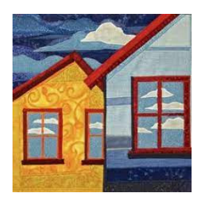
Very Good News Two Families from Last Season Are Now Housed

They were unhoused at the end of last season have found a home and have moved in to their new places.