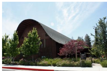
Episcopal Church of the Resurrection Host Coordinator: Janelle Towles

(We do not publish the Shelter's current site to protect the privacy and security of our guest families)