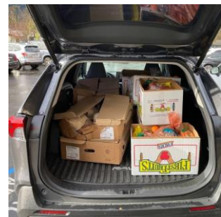
Knights of Columbus food boxes headed to WN alumni families