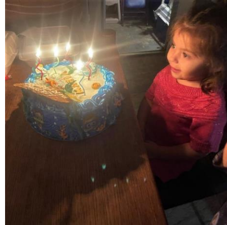
Brother and Sister celebrate their birthdays together. Thank you, Cakes4Kids, for making their celebrations so special