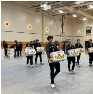
De La Salle Soccer Team moving heavy boxes of food to waiting vehicles