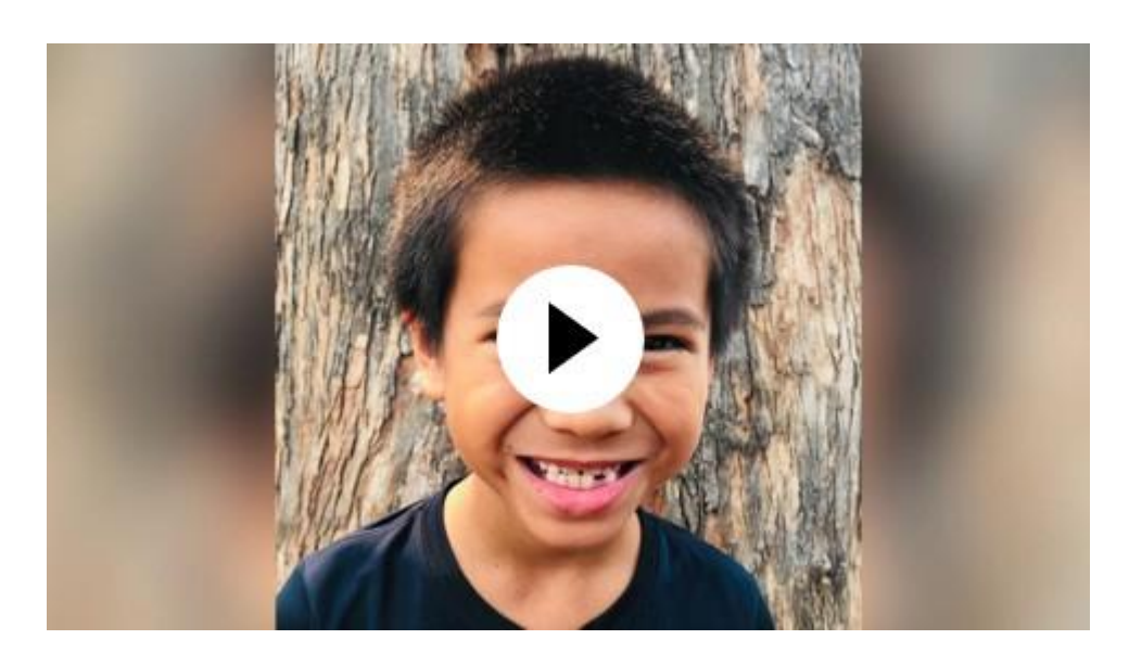
Stories from Two Families - Family Shelter 2020