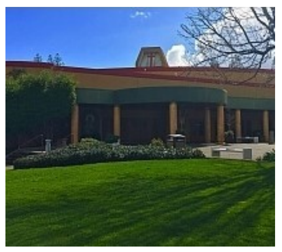
St. Bonaventure's Catholic Church Concord