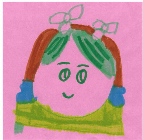
Winter Nights Family Shelter - Child's Artwork

For questions or assistance please call the office 925-414-3883 Or email Winter Nights at the CONTACT US link below