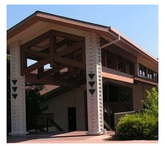
Temple Isaiah Lafayette