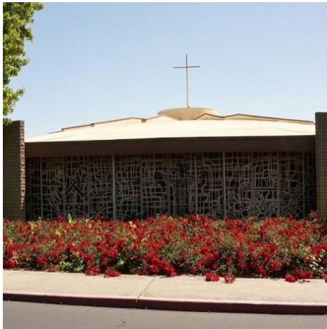
Saint John Vianney Catholic Church - Walnut Creek