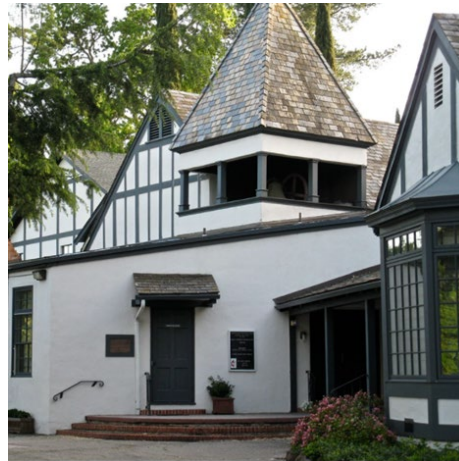
Lafayette United Methodist Church - Lafayette

There was a HAPPY BIRTHDAY at the Family Shelter for a father of two.