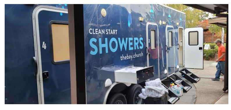
Thank you to The Bay Church for their portable showers at St. Anselm's