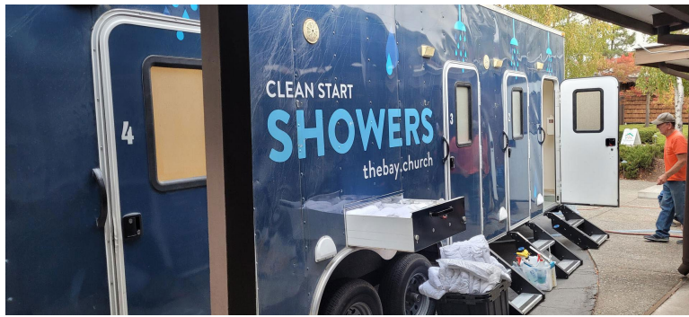
Thank you to The Bay Church for their portable showers at St. Anselm's